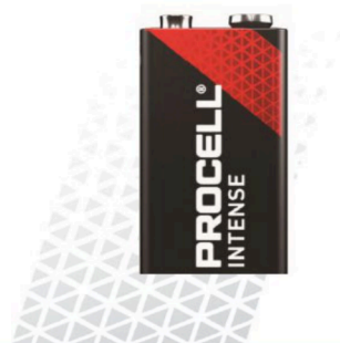
Size: 9V (6LR61) PX1604