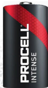
Size: D (LR20) PX1300